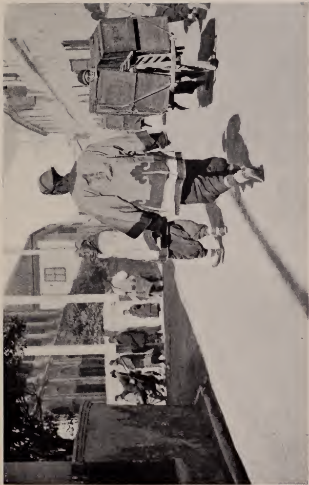
SOLDIERS IN SHANGHAI.